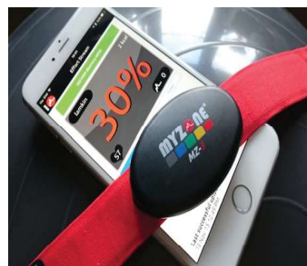
Belt may be used in and out of the facility!

LEHI LEGACY CENTER 123 North Center Street 385.201.2000 www.lehi-ut.gov/legacy-center